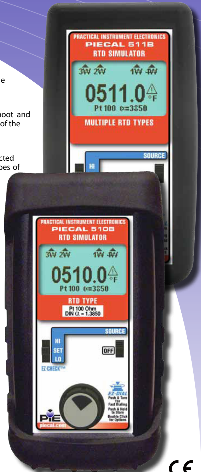
Actual Size (Shown with optional boot)

* PIECAL Calibrators are not manufactured or distributed by Fluke Corp or Altek Industries Inc, manufacturers of Altek Calibrators.